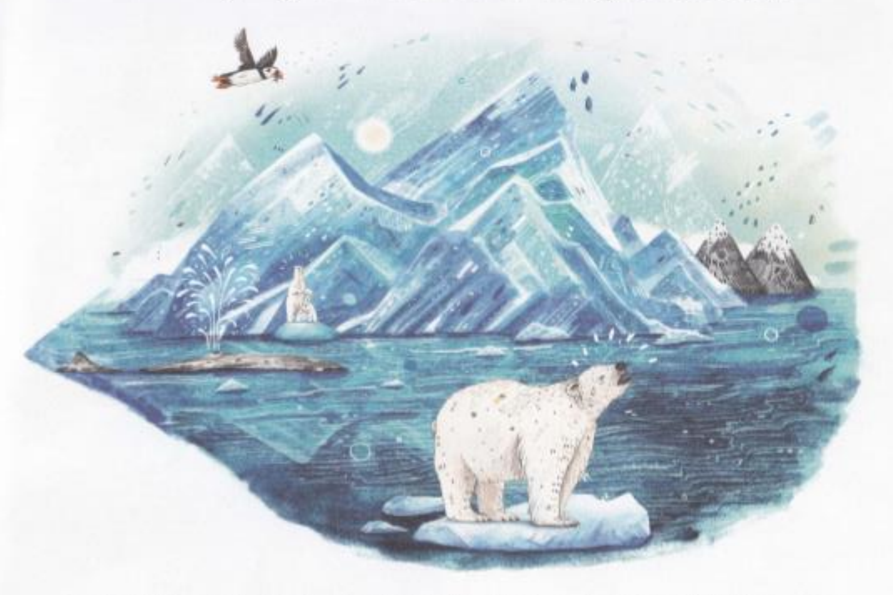
And so it was decided. The crows would help Leaf and fly him home...

Just someone who wished he could fly back home. How silly they had all been for not talking to him sooner!