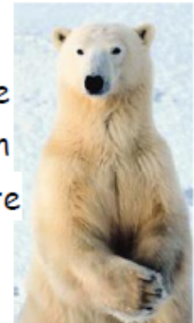
A young male polar bear.

Polar bears can be 10 feet tall, that's the size of three first graders on top of each other. They have thick white fur and dark brown eyes.