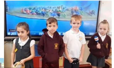
Year 1 acting out and performing Humpty Dumpty.