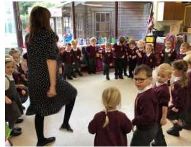
FS1 joined in with National Poetry day focusing on nursery rhymes.

Year 4, 5 and 6 wrote their own poems during the day. Their poems focused on themes of friendship and space, and some were inspired by kenning poems. On Friday afternoon, children performed their poems to a large audience in a special KS2 poetry performance assembly.