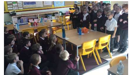
Year 3 performing their class poems to year 2