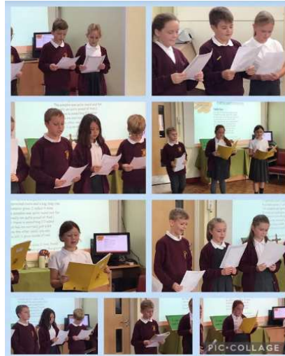
Year 5 poetry performances