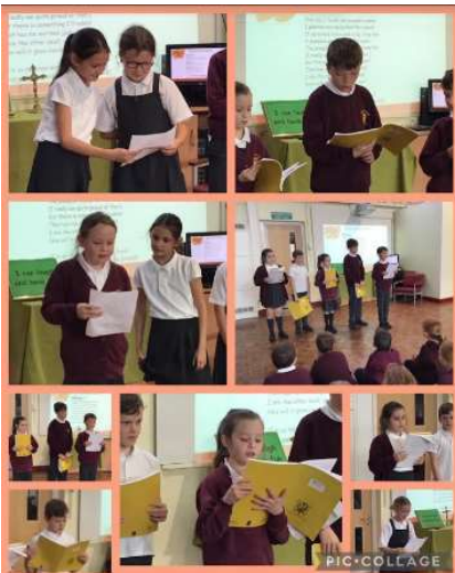
Year 4 poetry performances