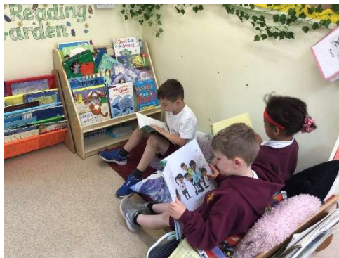
Year 1 reading garden

https://www.amazon.co.uk/hz/wishlist/ls/3QL2CNKMTS7GT?ref=wl_s_hare