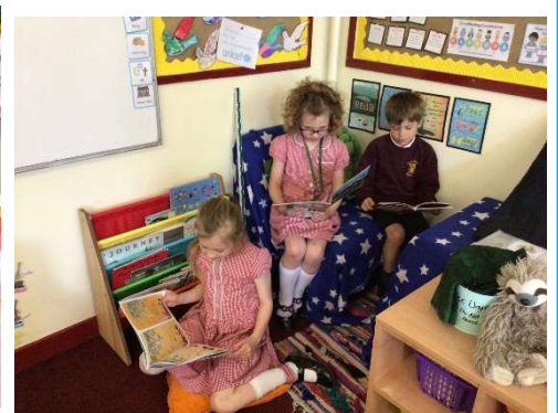
2RL reading corner...