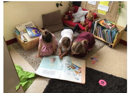
FS2 reading corner...

Next half term we are looking forward to story time in the hall with members of staff. We are also going to be reading to our peers in other year groups too. We are looking forward to sharing stories and books.