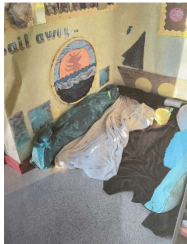
2HW reading corner