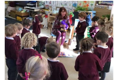
FS1 listening to and retelling The Smeds and the Smoos.