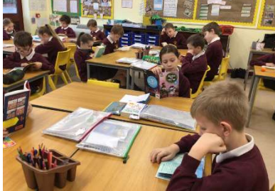
4LS reading for pleasure and their advent book box!