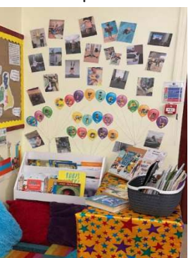
3EJ have a great selection of books and display of interesting places to read...